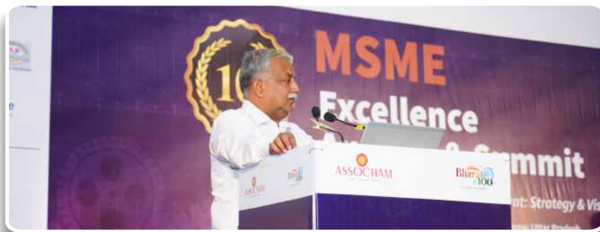
Shri Awanish Awasthi , IAS Advisor to Hon'ble Chief Minister Government of Uttar Pradesh, Addressing at ASSOCHAM 10th MSME Excellence Awards: 2024