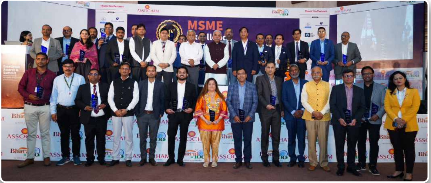
Winners group photo with Shri Rakesh Sachan , Hon'ble Cabinet Minister of Micro, Small & Medium Enterprises, Government of Uttar Pradesh and Shri Awanish Awasthi , IAS Advisor to Hon'ble Chief Minister Government of Uttar Pradesh at 10th MSME Excellence Awards: 2024