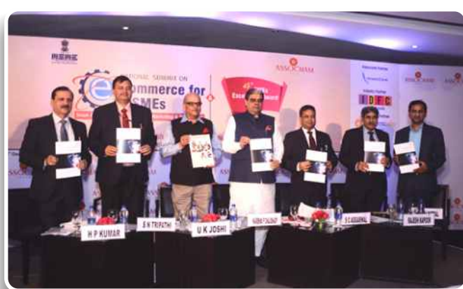
Shri Haribhai Parathibhai Chaudhary , Former Minister of State for MSME, Government at 4th MSME Excellence Awards: 2016