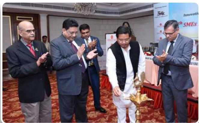
Hon'ble Chief Minister of Meghalaya Shri Conrad K Sangma at ASSOCHAM 6th MSME Excellence Awards: 2019