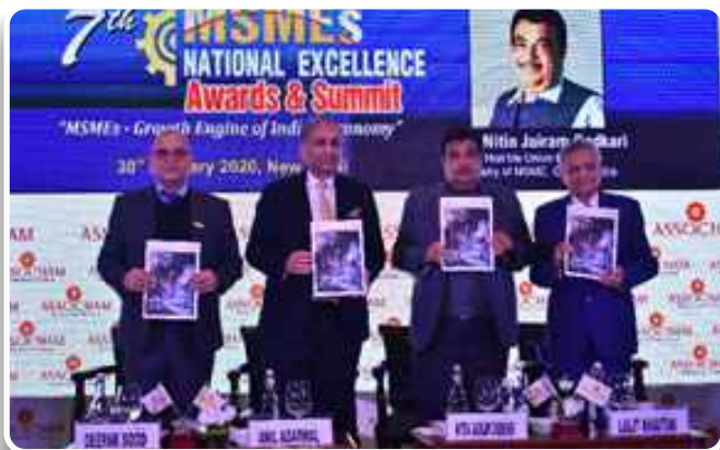
Shri Nitin Jairam Gadkari Minister for Road Transport & Highways (former Union Minister Minister of MSME), Government of India at 7th MSME Excellence Awards