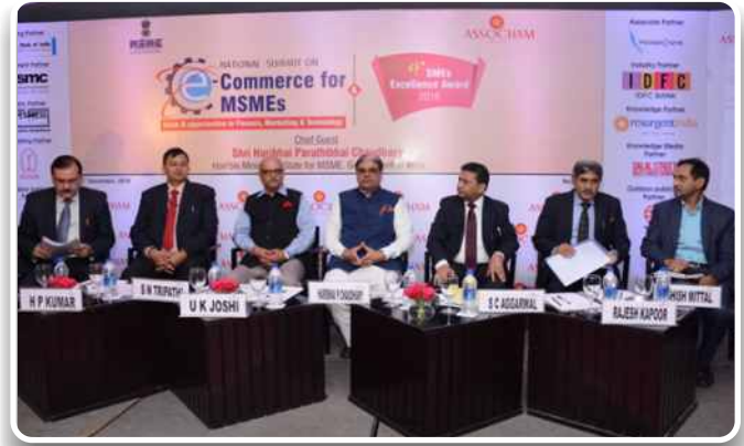
Shri Haribhai Parathibhai Chaudhary , Former Minister of State for MSME, Government at 4th MSME Excellence Awards: 2016