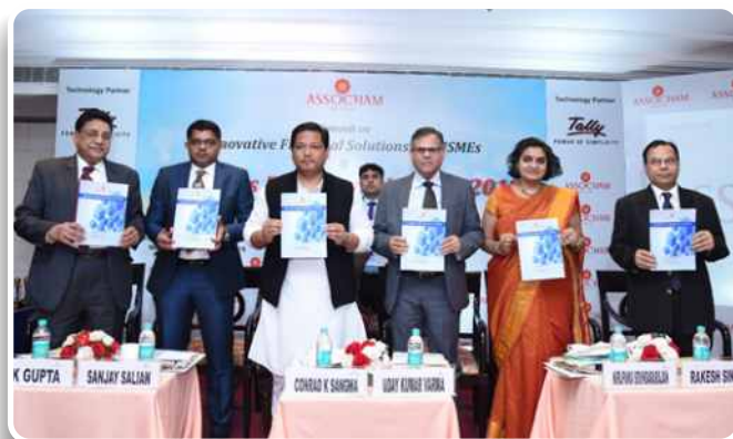
Hon'ble Chief Minister of Meghalaya Shri Conrad K Sangma at ASSOCHAM 6th MSME Excellence Awards: 2019