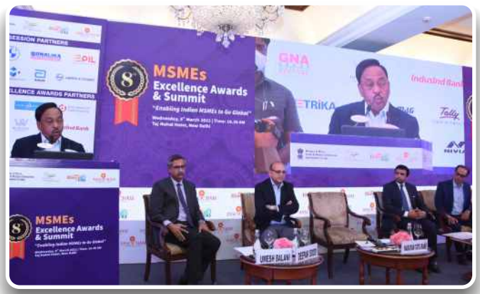
Shri Narayan Tatu Rane , Hon'ble Union Minister of MSME Government of India Addressing at 8th MSME Excellence Awards 2022