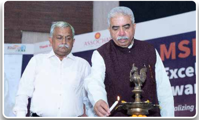
Shri Rakesh Sachan , Hon'ble Cabinet Minister of Micro, Small & Medium Enterprises, Government of Uttar Pradesh at ASSOCHAM 10th MSME Excellence Awards: 2024