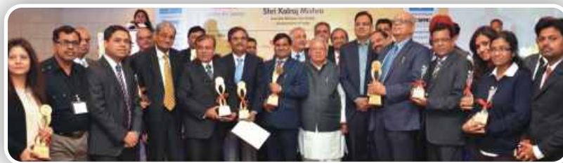
Shri Kalaj Mishra , Hon'ble Union Minister for MSME, and other jury members along with the award Winners at an ASSOCHAM Summit on Financial Restructuring for MSME Lifeline for Success' & 2nd SMEs Excellence Award 2014 held in New Delhi.