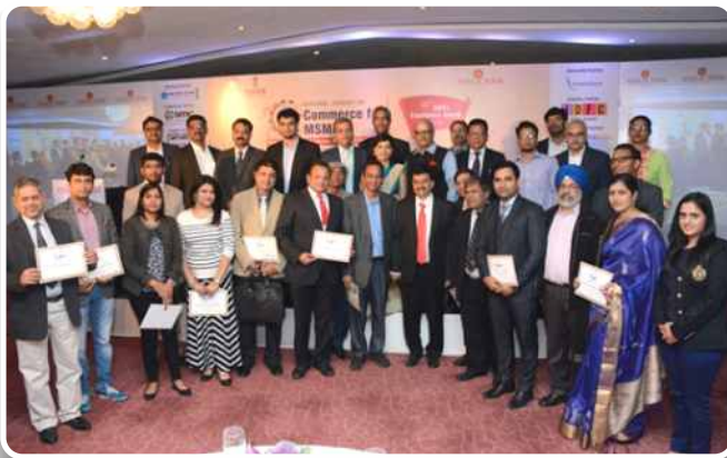
Winners group photo with Shri Haribhai Parathibhai Chaudhary , Former Minister of State for MSME, Government at 4th MSME Excellence Awards: 2016