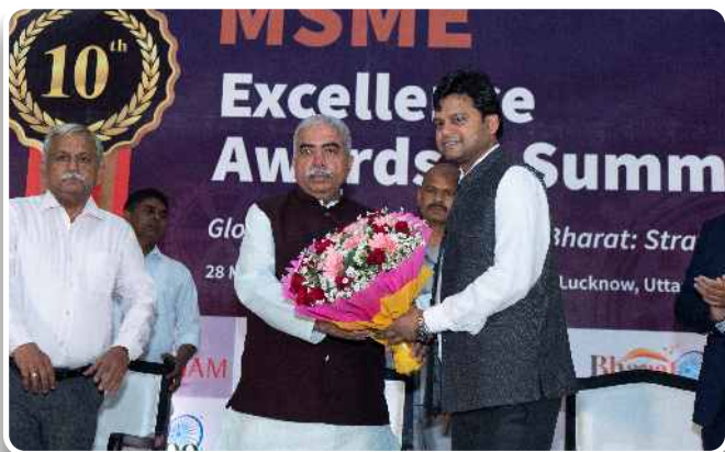
ASSOCHAM facilitating Shri Rakesh Sachan , Hon'ble Cabinet Minister of Micro, Small & Medium Enterprises, Government of Uttar Pradesh at ASSOCHAM 10th MSME Excellence Awards: 2024