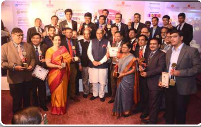
Winners group photo with Shri Haribhai Parathibhai Chaudhary , Former Minister of State for MSME, Government at 4th MSME Excellence Awards: 2016