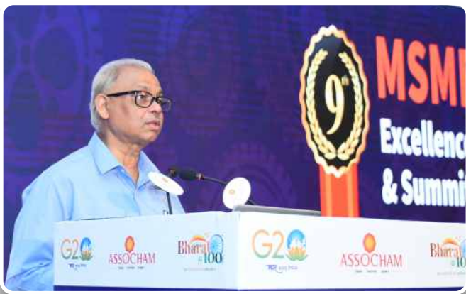
Shri B.B. Swain , Secretary Ministry of MSME Government of India Addressing at 9th MSME Excellence Awards 2023