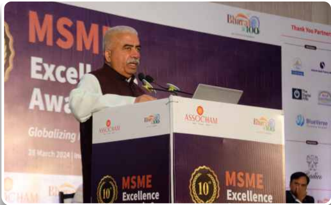
Shri Rakesh Sachan , Hon'ble Cabinet Minister of Micro, Small & Medium Enterprises, Government of Uttar Pradesh Addressing at 10th MSME Excellence Awards 2024