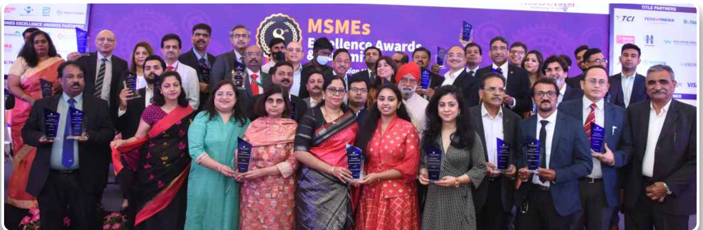
Winners Group Photo with Shri Narayan Tatu Rane Hon'ble Union Minister of MSME Government of India at 8th MSME Excellence Awards 2022