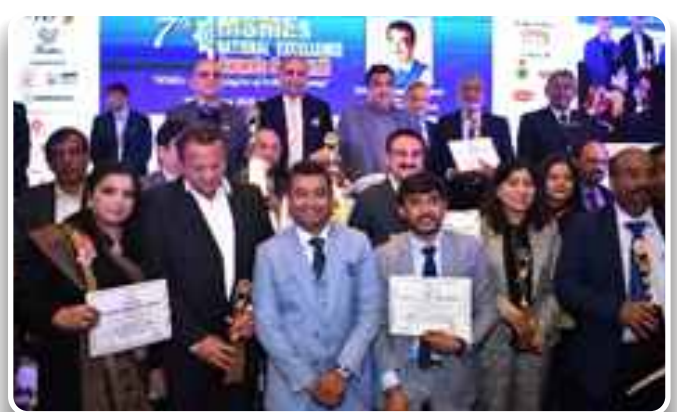
Winners Group Photo with Shri Nitin Jairam Gadkari , Minister for Road Transport & Highways (former Union Minister Minister of MSME), Government of India at 7th MSME Excellence Awards