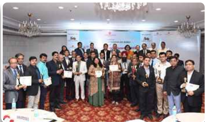
Winners group photo with Hon'ble Chief Minister of Meghalaya Shri Conrad K Sangma at ASSOCHAM 6th MSME Excellence Awards: 2019