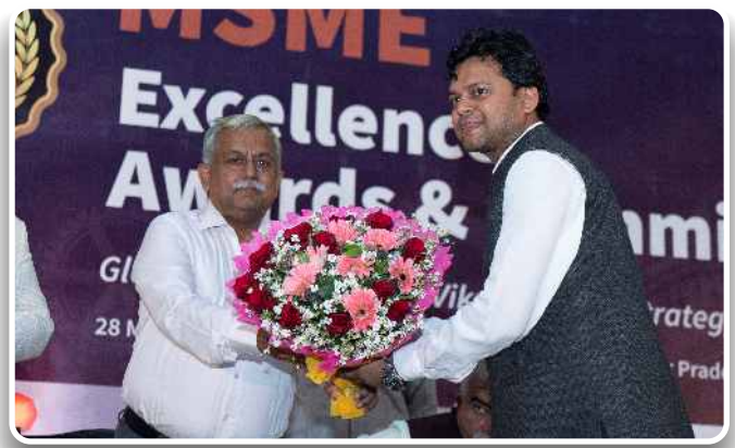
ASSOCHAM facilitating Shri Awanish Awasthi , IAS Advisor to Hon'ble Chief Minister Government of Uttar Pradesh, at ASSOCHAM 10th MSME Excellence Awards: 2024