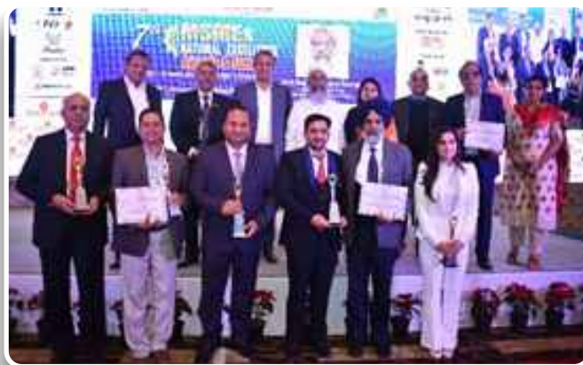
Winners group photo with Shri Pratap Chandra Sarangi , former Minister of State in the Government of India for Animal Husbandry, Dairying and Fisheries and Micro, Small and Medium Enterprises, Government of India at 7th MSME Excellence Awards