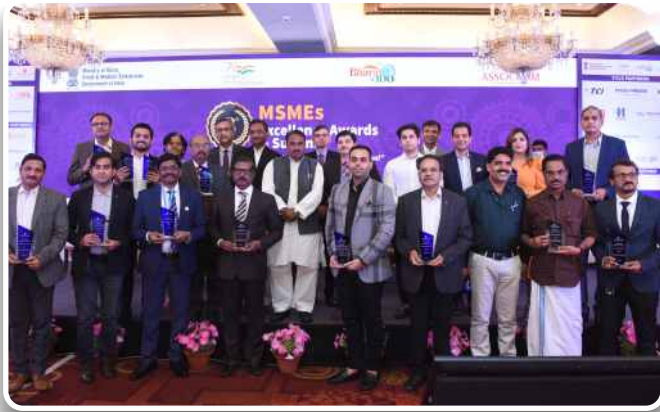
Winners Group Photo with Shri Bhanu Pratap Singh Verma , Hon'ble Minister of State MSME Government of India at 8th MSME Excellence Awards 2022