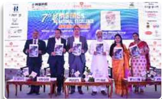
Shri Pratap Chandra Sarangi , former Minister of State in the Government of India for Animal Husbandry, Dairying and Fisheries and Micro, Small and Medium Enterprises, Government of India at 7th MSME Excellence Awards